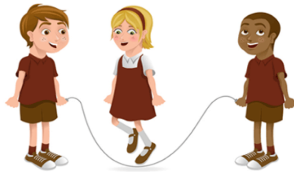
Sports Skipping for Schools Ltd.

We have invited Sports Skipping for Schools to host an all day skipping coaching session when our children will have the opportunity to learn a range of skipping skills.